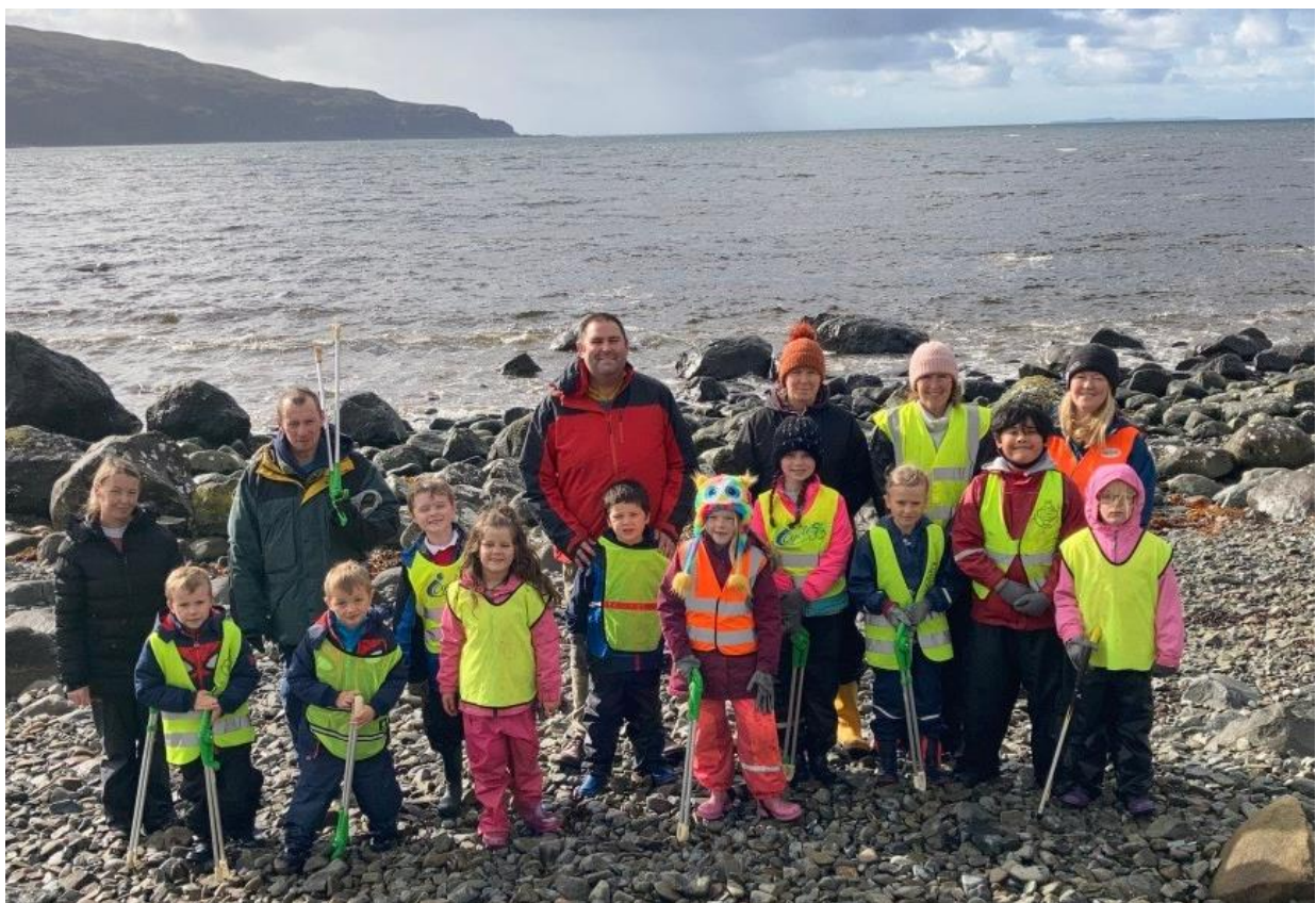
Parents helping with our beach clean at Loch Buie in September 2021.

The attendance figures, over the last 5 years, at Lochdonhead Primary School, are very good and we have had no exclusions.